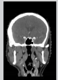
CT SCAN CONTOUR COMPARISON