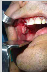
CANCER OF UPPER JAW